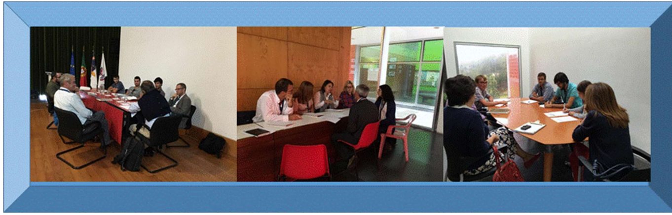
Figura 2. The Speed Dating Science groups in the meeting rooms.

Each leader worked as a facilitator, assisting the group participants in order to highlight the meeting purpose and promote and register the discussion. The chairperson function was to promote the brainstorming, asking for at least two ideas about each question, to foster debate among the participants about the SDS rural development and record all the answers (there were not wrong answers, all of them were important). The questions were always the same in each meeting room. The chairperson stayed in the meeting room while the volunteers were referred to the following room. As a result, the three volunteers' groups responded to the six questions, and they could only contact the persons in their own group.